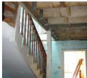
New Joists at 5th Floor