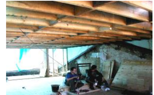
5th Floor During Construction (Note Profile of Old Roof in Background)