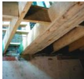
New Timber Spine Beam

CORNWALL GARDENS, KENSINGTON, LONDON SW7