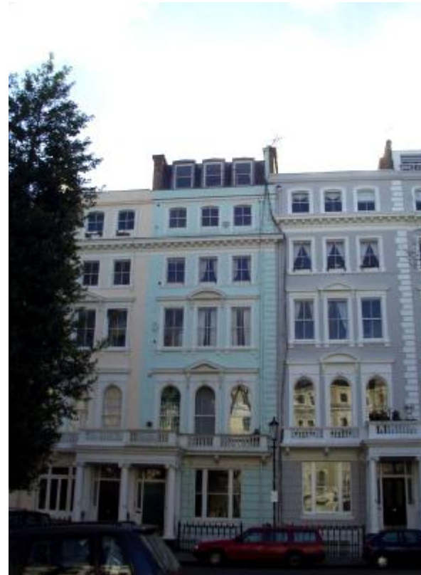
Front Elevation Showing New Roof Extension