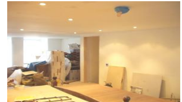
New Fifth Floor