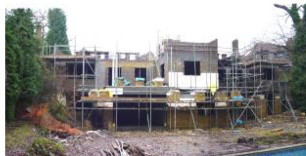
Construction of Rear Elevation