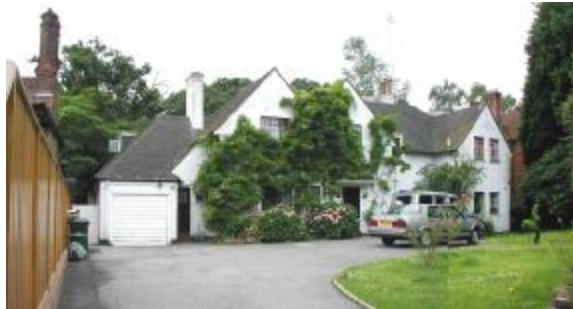
Original Front Elevation (Retained)

Civil & Structural Engineers, CDM Coordinators & Party Wall Surveyors