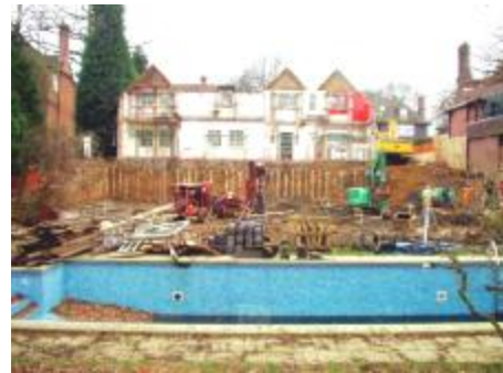
Rear Elevation (Excavation for New Basement)