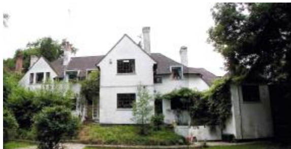
Original Rear Elevation (Demolished)