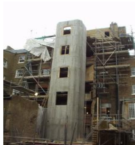
Construction of New Lift Shaft, Stair Core & Rear Extensions