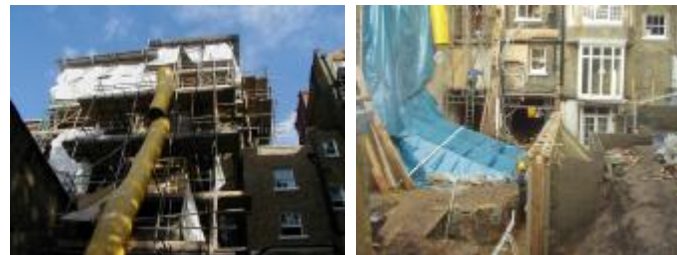
Demolitions, Structural Alterations and Extensions