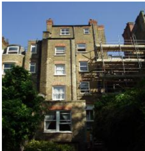
Original Rear Elevation