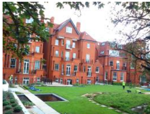
New Rear Elevation