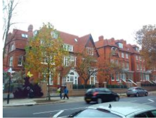
New Front Elevation