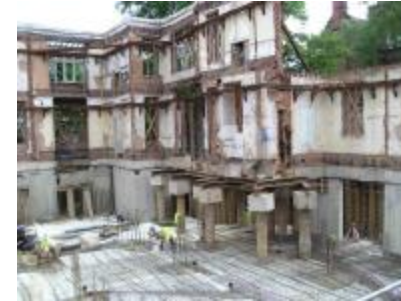
Facade Retention & New Lower Lower Ground Floor