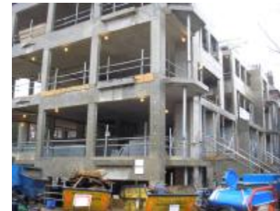
New Reinforced Concrete Frames