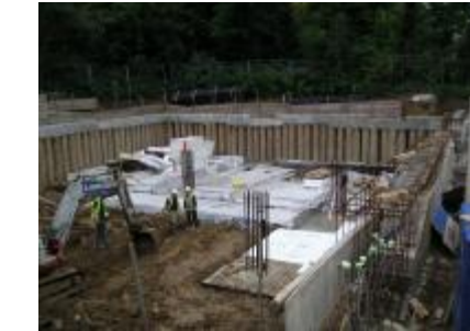
New Rear Below Ground Car Park

FITZJOHN'S AVENUE, HAMPSTEAD, LONDON NW3