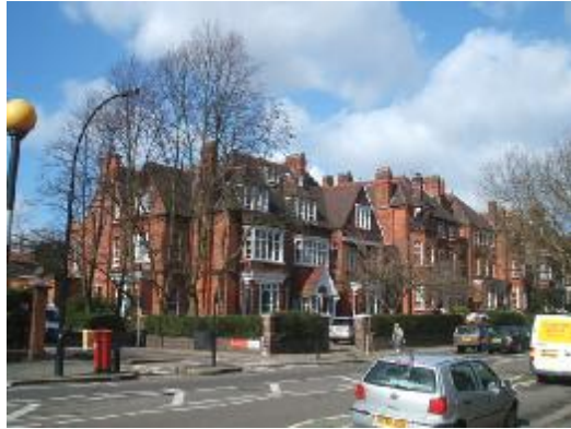
Original Front Elevation

Civil & Structural Engineers, CDM Coordinators & Party Wall Surveyors