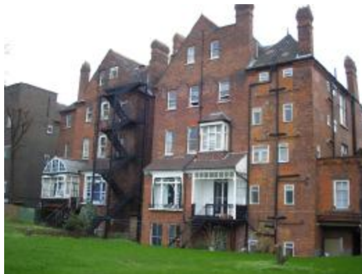
Original Rear Elevation