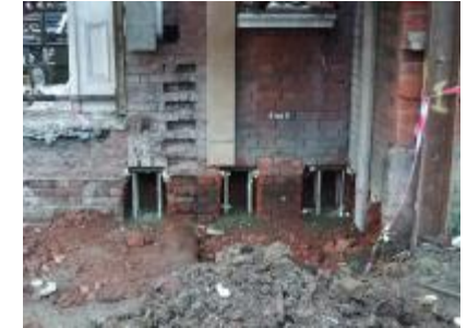
Temporary Works Stools