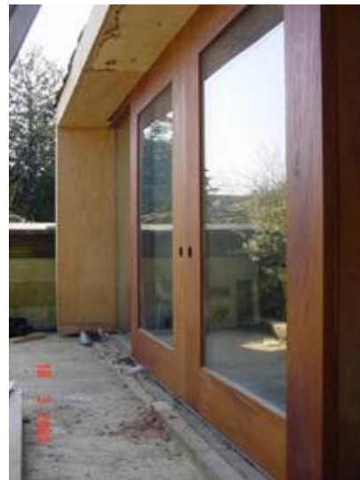
Patio Doors to Rear Garden