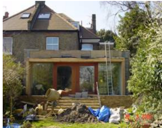
New Rear Elevation