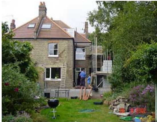
Original Rear Elevation