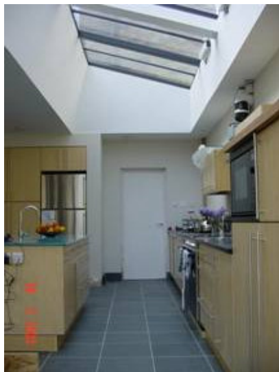
Kitchen in New Extension